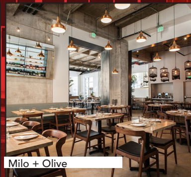
Milo + Olive