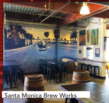
Santa Monica Brew Works