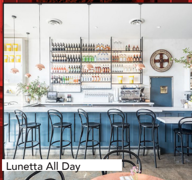
Lunetta All Day