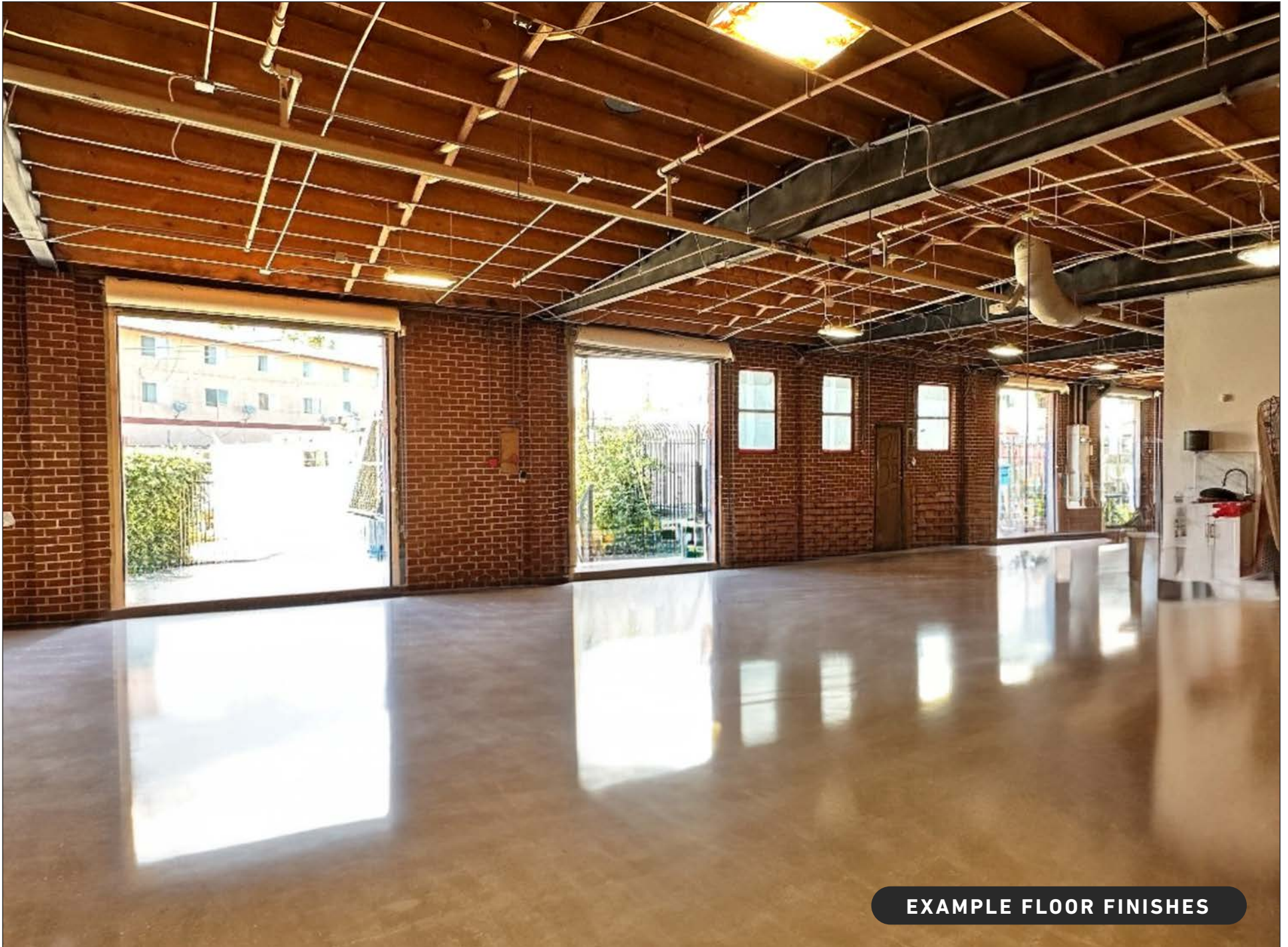
EXAMPLE FLOOR FINISHES