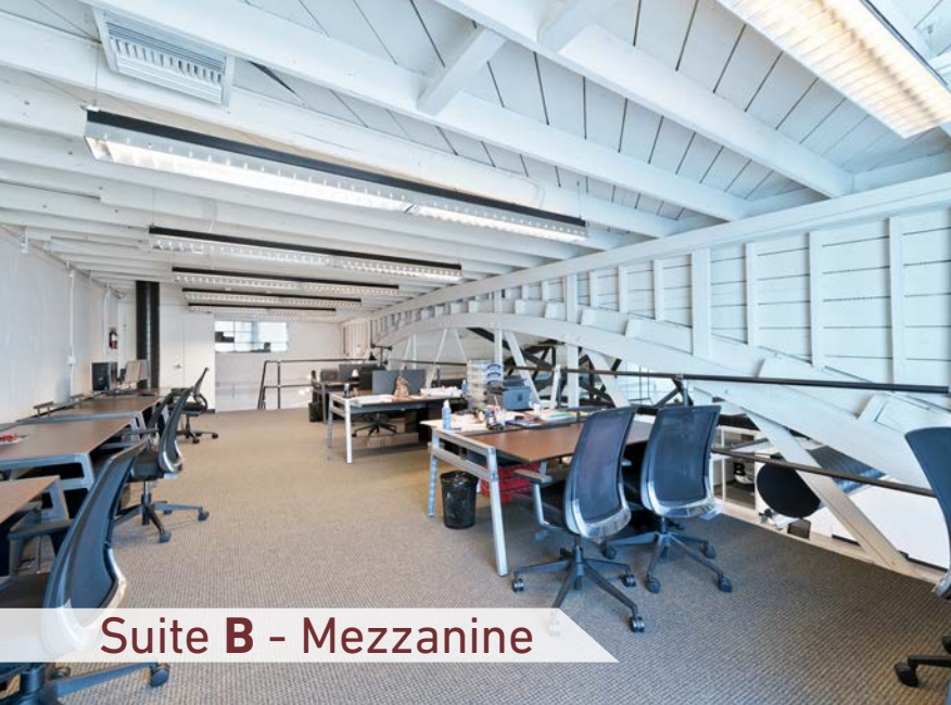
Suite B - Mezzanine