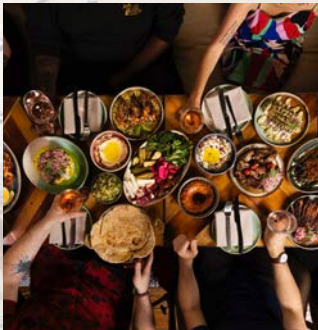
MAYDAN MARKET 4301 W Jefferson Blvd

Located in the vibrant West Adams neighborhood, 4522 W Jefferson Blvd presents a prime commercial opportunity in one of LA's burgeoning creative hubs. The property is within walking distance of Highly Likely Café and the soon-to-open Maydan Market—a marketplace curated by a Michelin Rated Star Chef. This locale offers an excellent space for businesses seeking to thrive in a dynamic, well-connected community. West Adams is experiencing a boom in forward-thinking businesses, especially in post-production, entertainment, and creative industries. This influx of companies is turning the neighborhood into a premier destination for top talent, attracting more foot traffic, energy, and investment. With ongoing development and a growing roster of high-profile businesses, 4522 W Jefferson Blvd offers a fantastic opportunity to be part of West Adams' exciting transformation.