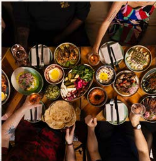
MAYDAN MARKET 4301 W Jefferson Blvd

Located in the vibrant West Adams neighborhood, 4522 W Jefferson Blvd presents a prime commercial opportunity in one of LA's burgeoning creative hubs. The property is within walking distance of Highly Likely Café and the soon-to-open Maydan Market—a marketplace curated by a Michelin Rated Star Chef. This locale offers an excellent space for businesses seeking to thrive in a dynamic, well-connected community. West Adams is experiencing a boom in forward-thinking businesses, especially in post-production, entertainment, and creative industries. This influx of companies is turning the neighborhood into a premier destination for top talent, attracting more foot traffic, energy, and investment. With ongoing development and a growing roster of high-profile businesses, 4522 W Jefferson Blvd offers a fantastic opportunity to be part of West Adams' exciting transformation.